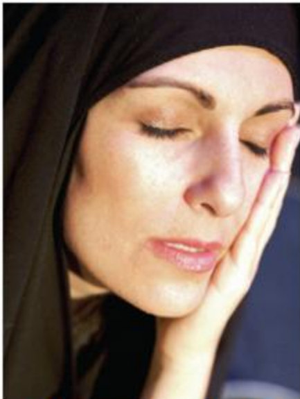
An intensely moving look at the war's impact on Iraqi women.

On Thursday, October 2 a group of senior social work students from Taylor University in Fort Wayne, Indiana spent the day with ACC's Behavioral Health Program. The students spent two days in the Detroit area visiting different agencies that work with specialized ethnic groups. The class broke down into groups of 5 and each group will present on their assigned ethnic group at the end of the semester. The group that visited ACC, learned about the different Arabic cultures, family dynamics, treatment approached and interventions. They were given an overview of the services we provide and how they should approach working with individuals from the Middle East as they move into the workforce.